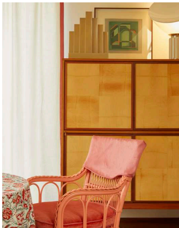
Table Linen Cabana Carpets Altai Gallery